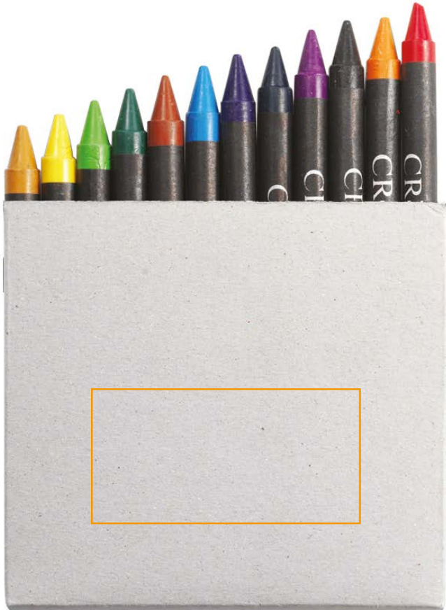
1. FRONT SIDE